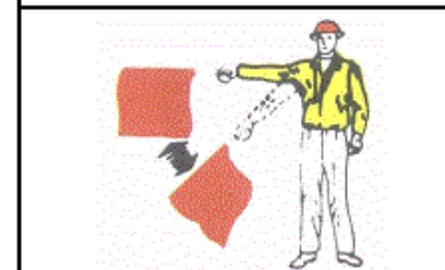
TRAFFIC SHOULD BE CAUTIOUS