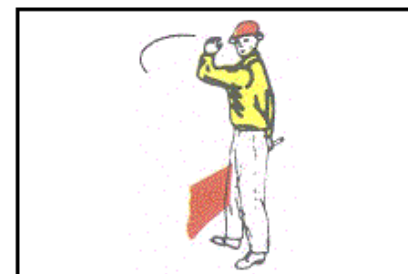
TRAFFIC MUST PROCEED